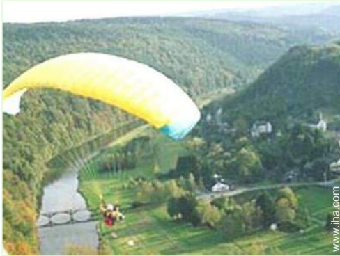
flying pursuits nearby