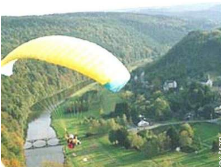
flying pursuits nearby