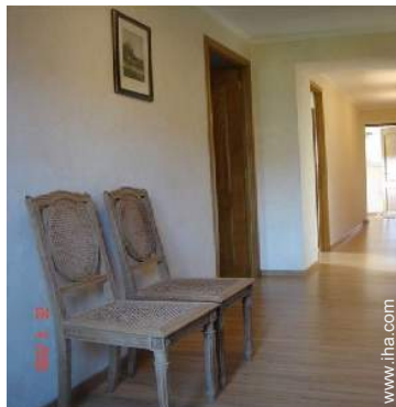
view from the mezzanine