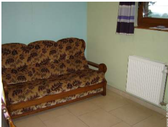
foldaway bed(s) 2 pers