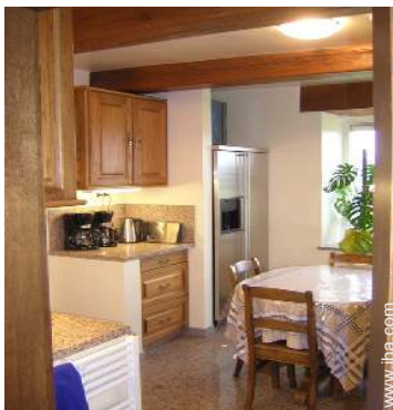
large seperate kitchen