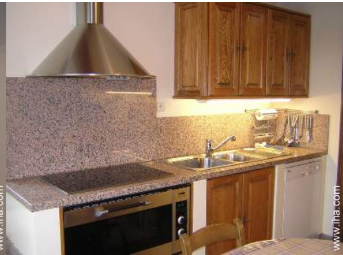
large seperate kitchen