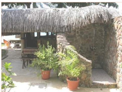
outside shower facilities

Benefits : Direct access to the beach, mooring