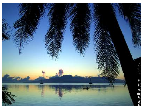
view over the ocean