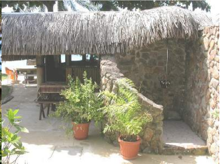
outside shower facilities