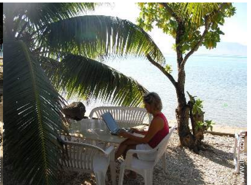
wifi (wireless internet access)