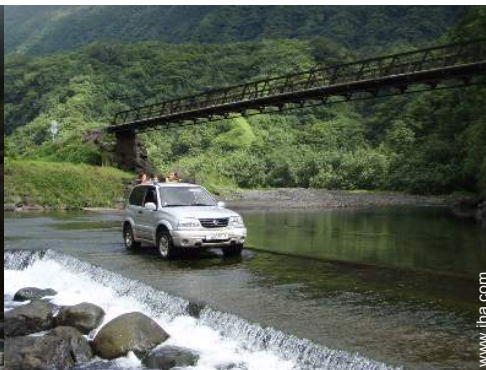
mountain pursuits nearby