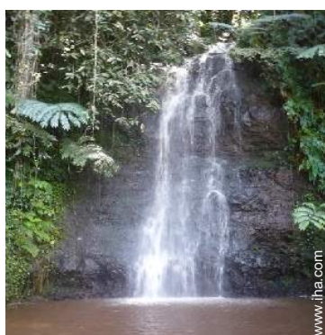
mountain pursuits nearby