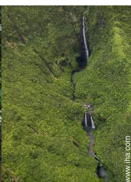
flying pursuits nearby