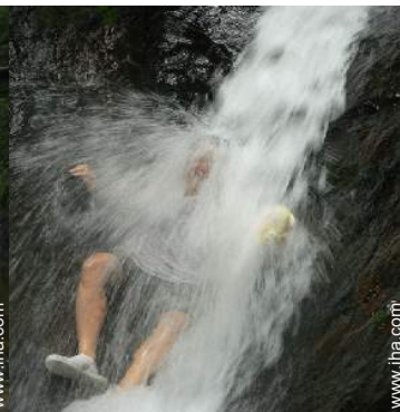
mountain pursuits nearby