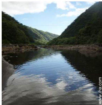
mountain pursuits nearby