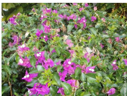
Outside at the guests disposal